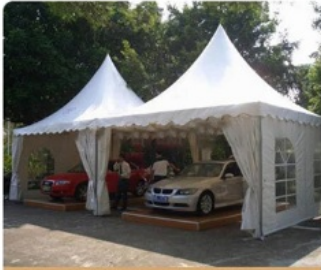
Mobile car show