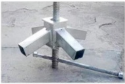
Top adjustment point fitting