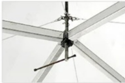
Top adjustment point