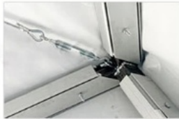
Corner support node real shot