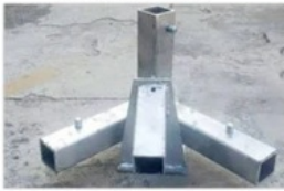
Corner support node fittings