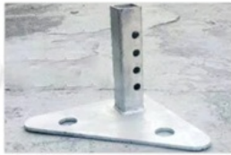
Support column interface base