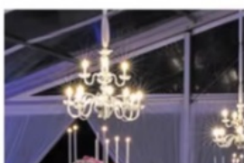
lamps and lanterns