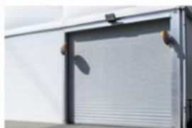
Rolling Shutter Door