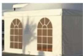
PVC Transparent Wall