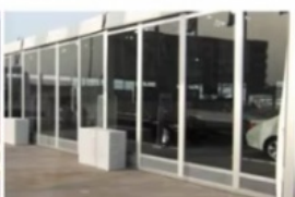
Glass Screen Wall